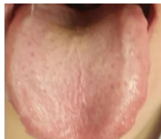
Figure 2: Coating on the tongue (Second diagnosis).

Second diagnosis: June 17, 2022. After taking the medicine, the patient's sleep condition was preliminarily improved, the time to fall asleep was shortened, it was difficult to wake up after sleeping, and she had night sweats, reddish tongue, thin yellowish mass, and pulse strings. At present, the patient is dialectic and accurate, and the development of the disease is relatively stable and developing in a good direction. Now we should strengthen the method of nourishing Yin for the patient, modify the original formula, add 10g turtle shells, 10g vinegar schisandra seed, and reduce the amount of sauted jujube kernel to 15g, minus the preparation of Yuan-zhi. Decoction in water, 7 pay, 1 dose per day, divided into 2 times. (Figure 2)