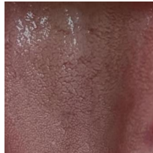
Figure 4: Coating on the tongue(Fourth diagnosis).

Fourth diagnosis: On July 05, 2022, the patient had good sleep, no night sweats, normal bowel movements, pale red tongue, thin yellow mass, and string pulse. The patient was instructed to continue the oral administration of the original prescription for half a month for consolidation, and was followed up for more than 3 months without recurrence. As shown in Figures 4 and 5.