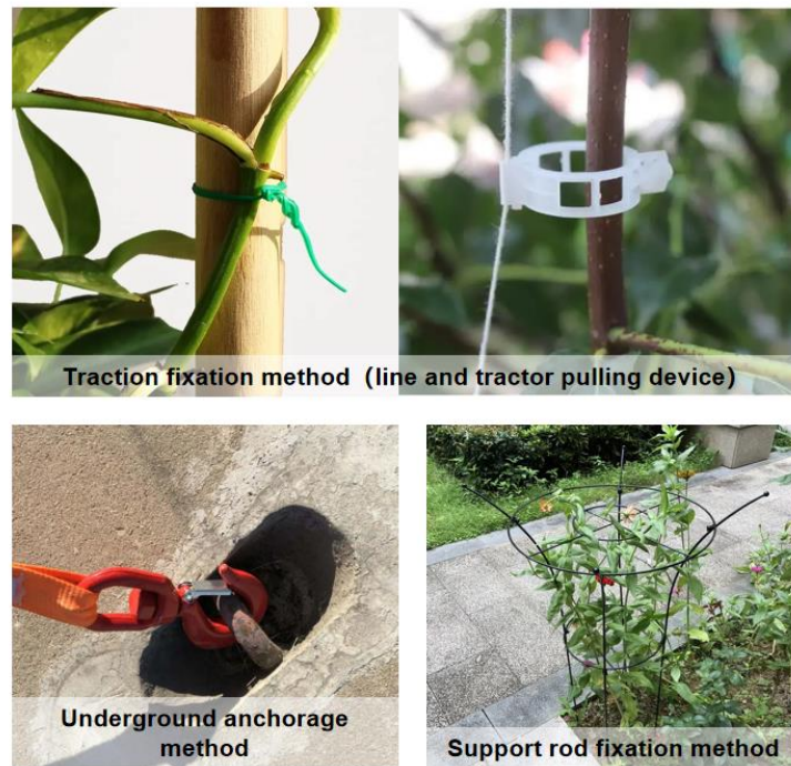
Figure 3: The method of roof greening plant fixation