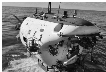
Fig.1 “Jiaolong” manned submersible