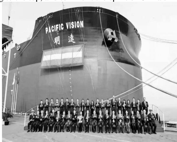
Fig.3 Shanghai Waigaoqiao Intelligent 400,000-ton ultra-large ore vessel

Combining the "Jiaolong" manned submersible with Figure 1, we will teach the importance of the twists and turns of the profile design. With the unique wisdom of our countrymen, the chief design team of "Jiaolong" conquered the difficult design problem and designed a manned submersible with a shark-like shape [8] . The whole design process is full of twists and turns and difficulties, taking into account the overall appearance, performance in the water, hydrodynamic model and a series of factors, constantly adjusting, modifying and optimizing, and finally forming its optimal line shape, so the process of profile design is the process of continuous optimization. Combined with the Figure 2, "Jiaolong" mechanic put the national flag on the bottom of the South China Sea, teaching the proud achievement of "Jiaolong" is the result of the continuous struggle of the Chinese manned deep diving team for countless days and nights, they practice "rigorous pragmatism". The students were guided to establish a rigorous and realistic scientific attitude, and to firmly believe in climbing to the top, and to inherit the spirit of China's manned deep diving.