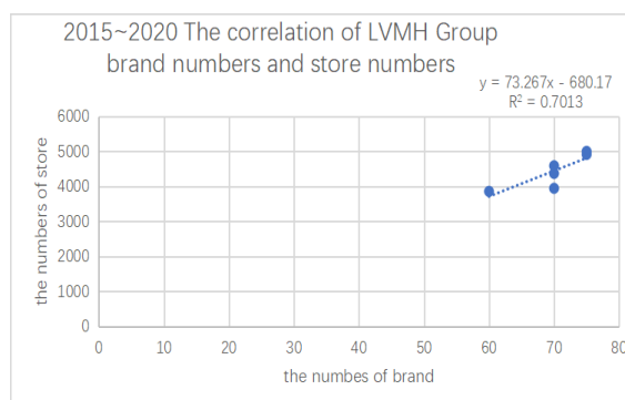
Figure 3: 2015-2020 the Correlation of LVMH Group Brand Umber and Store Numbers

starting in 2015, LVMH publishes its exact number of brands in its annual reports. We found that although there was a decrease in the R-value, there was still a positive strong correlation.