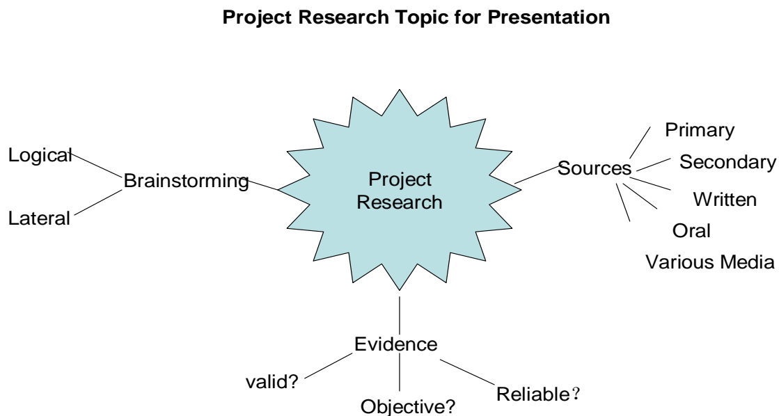
Figure 2: Project Research Topic for Presentation

In terms of evaluation, Haines (1989) suggests that as with any piece of work a project needs to be acknowledged and evaluated. Salter-Dvorak (2016, p30) thinks that the task of structuring and delivering an oral presentation on the material provides a learning opportunity which reflects their immediate needs and eclipses that of developing students' argumentation. And it is not enough to just say 'that's great' after all the work students have put in. He uses a simple project evaluation report finally, which not only comments on aspects of the task project including content, design, language skill, and also mainly evaluates the product presentation stage of the whole process of a project task. So, emphasis on formative assessment in ESP class will be keep teaching quality and students' learning. We set the final products described in class concerns the project tasks as a research topic for presentation by students. As Fig.2 shown.