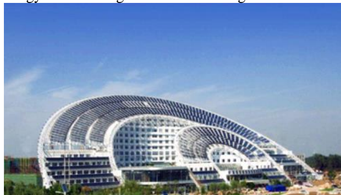
Figure 1: Texas Micro row Building

Texas micro row building, for example, it is the world's largest solar buildings, sun altar micro row building a total construction area of 75000 square meters, in the world to realize the solar hot water supply, heating, refrigeration, photovoltaic grid technology and building, building overall energy saving efficiency of 88%, can save 2640 tons of standard coal, 6.6 million degrees, reduce emissions 8672.4 tons, is the world initiative to realize the solar water heating, heating, refrigeration, photovoltaic grid technology and building [5] . As shown in Figure 1.