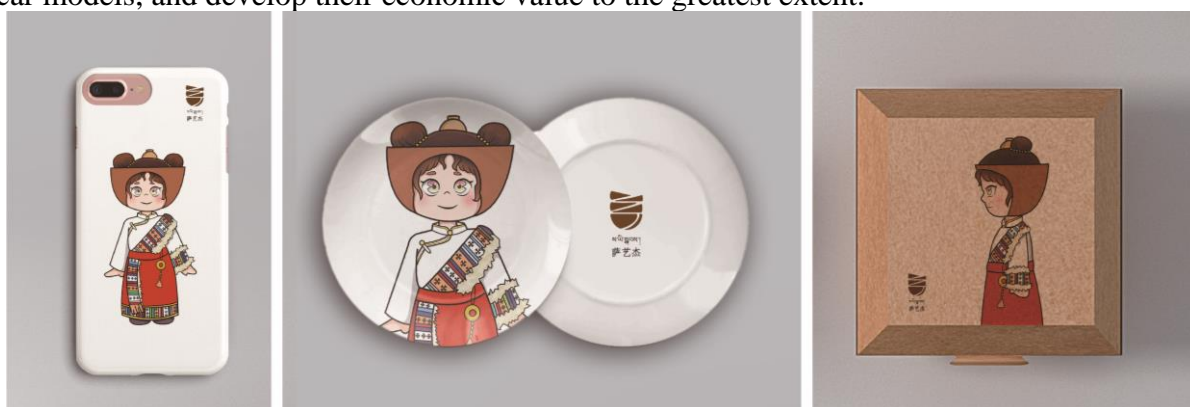
Figure 3: design scheme of "Sa Yijie" tourism cultural and creative products (part), Student author: YalingLan, instructor: JuSong

August 31, 2009, the National Tourism Administration of the Ministry of Culture issued the "Guidelines on Promoting the Combined Development of Culture and Tourism", which clearly stated that: "In-depth development of cultural tourism handicrafts (souvenirs), cultural administrative departments encourage creative production of cultural tourism handicrafts (souvenirs) in line with local cultural characteristics, mining the image value of tourism brands, and expanding the industrial chain of tourism brands" [5] . Therefore, it is an important measure to adapt to social development and meet the needs of consumers to develop cultural and creative products about Derong Tibetan folk car model craft with the help of the professional course "Tourism Cultural and Creative Product Design". "Culture empowers, design empowers", improve the cultural added value of car models, and develop their economic value to the greatest extent.