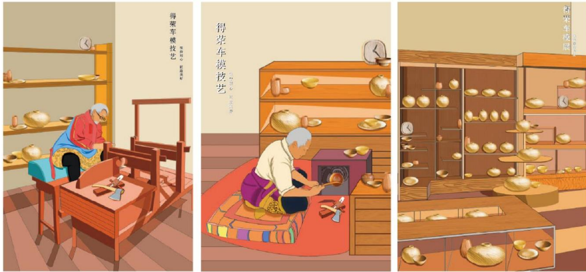
Figure 4: Design scheme of car model cultural print advertisement. Student author:Le Guani, YuliangLiang, LeiCao, instructor: JuSong

Figure 4 shows the homework of students majoring in visual communication design in the practical training of the course "Design of Print Advertisements" in our college -- the design scheme of print advertisements of car model culture, which honors Tibetan folk car model skills rather than specific corporate brands or car model products. Derong Tibetan folk car model art is located in a remote area of Garze Prefecture, which has little contact with the outside world due to inconvenient transportation. This series of print advertising design by the car model culture parts process scene, car model finished products as the performance object, with a full composition of hand-painted illustration form, with warm Tibetan characteristics of yellow as the main body, intuitive display of the car model culture history and characteristics.