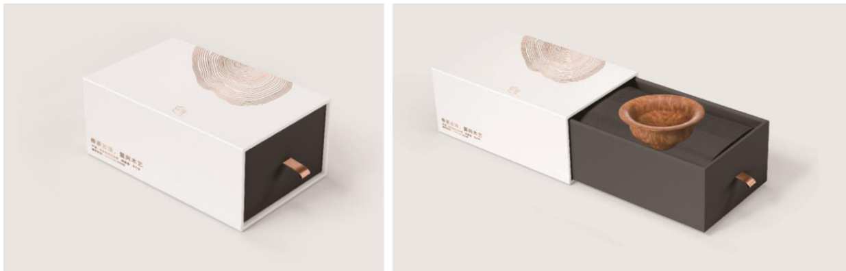
Figure 2: Packaging design scheme of Derong car model brand, student author:YulanLiao , XinyangWang, YiDeng , instructor: JuSong

Today, with the continuous upgrading of the market economy, packaging plays a pivotal role in commodities, just like the relationship between clothes and people, there is no doubt that beautiful packaging can foil commodities and promote the sales of commodities. In the modernization process of commodity homogenization, how to highlight the attributes and characteristics of commodities in packaging has always been the designer's thinking. Deyi, a virtual brand of Tibetan folk car model art, is integrated into the whole teaching process of Packaging Design to explore the cultural connotation of car models and create packaging designs that meet the aesthetic needs of the market.