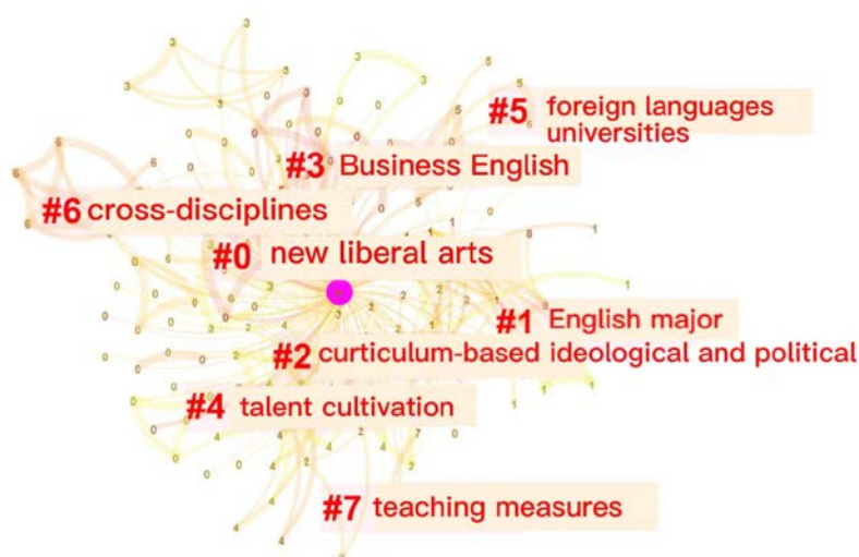
Figure 2: Keywords clustering map of Foreign Language Teaching under the Background of New Liberal Arts from 2019 to 2022

CiteSpace is a kind of bibliometric auxiliary software after all. Although it can analyze the research subject direction from an objective point of view, it is easy to overlook some research contents which are not prominent in features, but are often very important and cannot be used as the basis for determining the subject direction. Therefore, based on the expert opinion, keyword frequency, centrality and clustering, this study finally concludes that there are three key points in foreign language teaching research under the background of new liberal arts, namely cross-disciplinary study, combination of traditional arts and modern digital technology and cultivation of new foreign language talents.