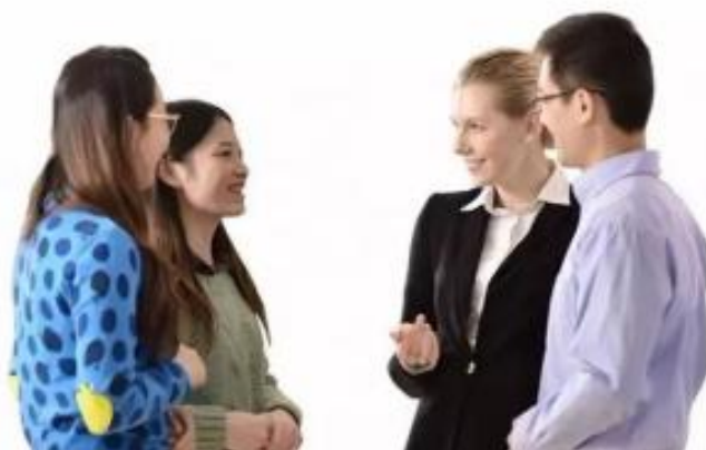
Figure 2: Teacher-student oral communication chart.

From the figure 2, Spoken English is an important way to achieve communication between people, and it can be used to achieve the transmission of information and the exchange of ideas and feelings. With the continuous development of higher education, society has raised new expectations for English teaching in colleges and universities to achieve healthy development of students through the development of their professional abilities [10] . Therefore, under the background of "Internet+" vision, colleges and universities need to conform to the development of the times, actively use Internet technology to carry out English speaking teaching, and make innovative changes to its teaching methods, abandon the traditional and boring way of teaching English speaking classroom, greatly mobilize students' learning enthusiasm and ignite the classroom atmosphere through the adoption of innovative methods, so as to create superior conditions for improving the classroom quality of speaking teaching.