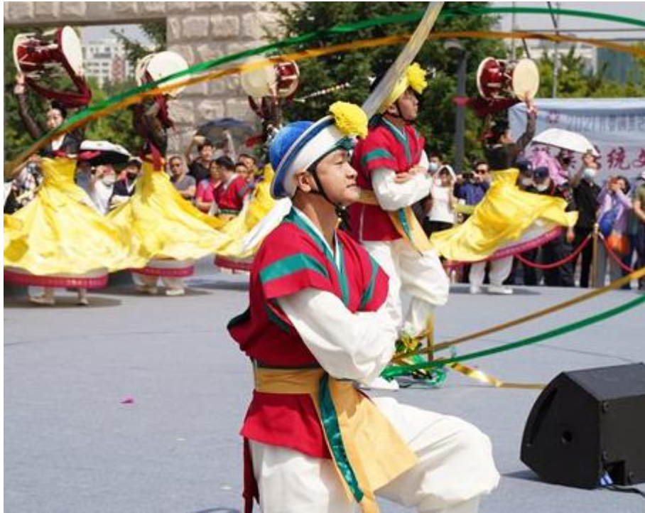
Fig.3 Korean Elephant Hat Dance