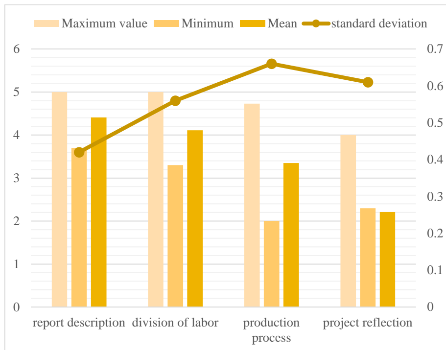
Figure 2: Project production report evaluation descriptive statistics

Specifically, as shown in Figure 2, through the analysis results, it is found that the structure of the reports of each group is reasonable, the logic is clear, and the division of labor among the members of the group is clear, but the ability to explain the work production process and the ability to reflect on the project production process needs to be strengthened.