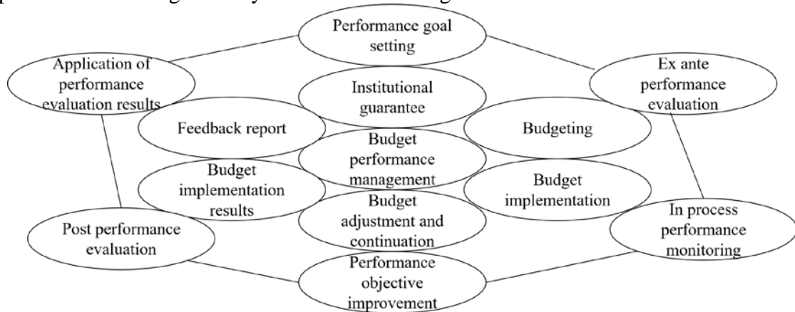
Fig.2 Basic Framework of Budget Performance Management System

rational allocation of resources by the school and avoid the deviation of actual implementation from the goal. Strengthen project library management. The basic framework for establishing the overall budget performance management system is shown in Figure 2.