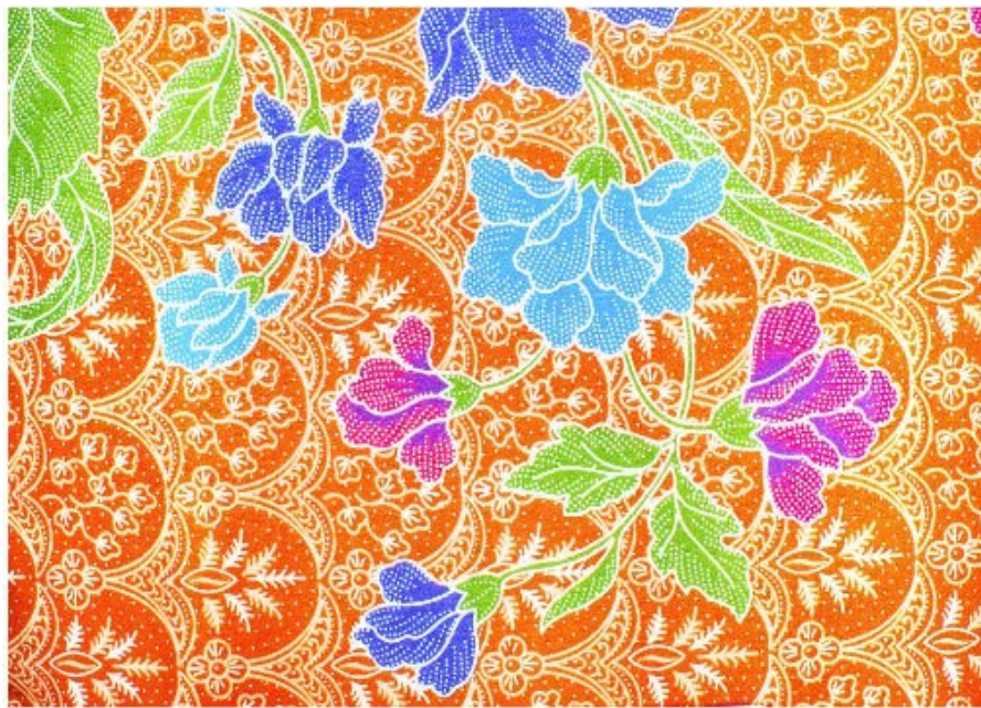
Fig.5 Batik Multicolor Pattern