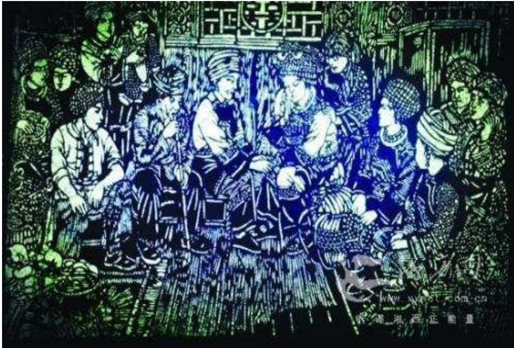
Fig.6 Ice Crack Pattern of Batik

It can be seen that Miao batik in Western Hunan is a kind of folk art. Its patterns and patterns have strong regional characteristics, and the content also has a certain historical origin and cultural heritage. With the long-term historical inheritance of Miao batik, it has formed its own unique style. There are different patterns in the description of patterns, which express the unique cultural connotation. From the functional point of view, due to the strong mobility of local residents living at that time, the pattern was drawn on clothes, which was easy to carry and inherit. At the same time, the patterns and shapes of the patterns have strong regional characteristics, forming different styles and styles from other regions, and infiltrating the lifestyle and behavior habits of Miao people in different places.