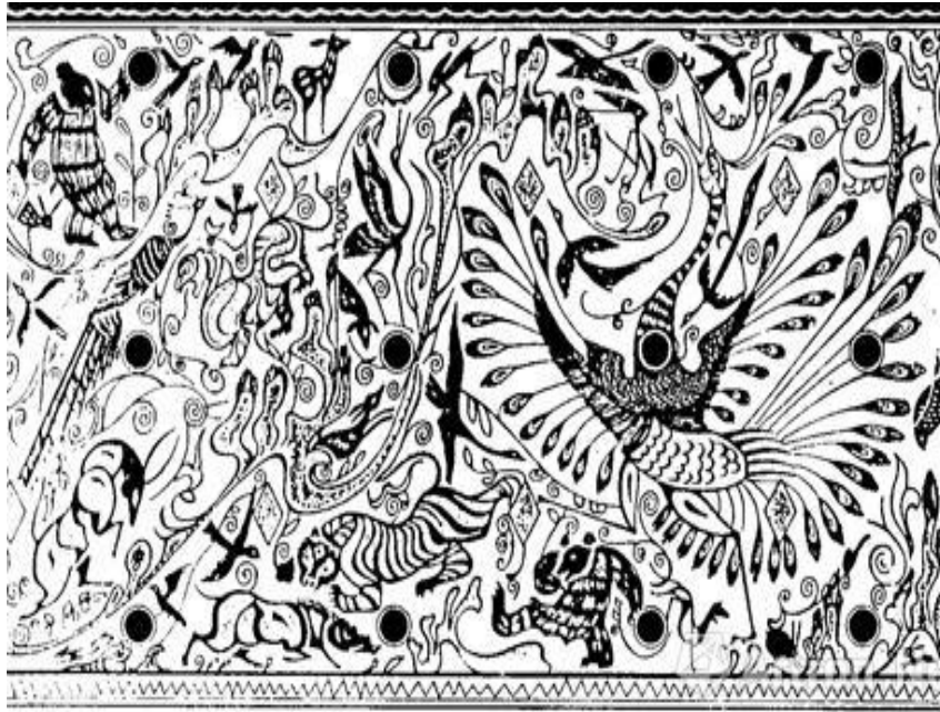
Fig.4 Batik Monochrome Pattern