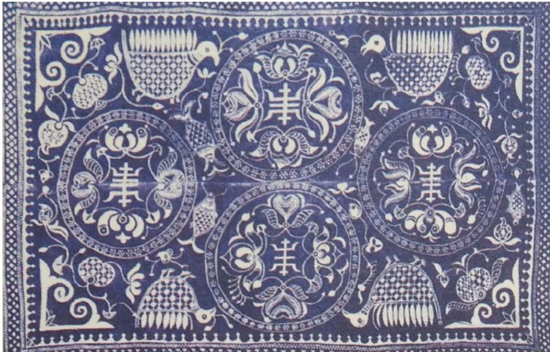
Fig.7 Batik Back of Miao People's Shouzi Flower and Bird Group Flower

The aesthetic value of Miao batik patterns in Western Hunan is mainly reflected in the sense of reproduction, life and religion. The sense of reproduction originates from people's reverence for life and people's pursuit of objective significance, which greatly affects the unique aesthetic value of batik patterns of Miao people. Life consciousness is the Miao people's understanding of the concept of survival. When the survival consciousness of life as a kind of cultural reproduction and people's vision, Miao people evaluate each individual life with truth, goodness and beauty, and penetrate into Miao batik culture. The religious consciousness mainly comes from people's admiration of witchcraft in primitive religion. In the religious activities full of truth and falsehood, the mystery of Miao folk art endows the Miao people in Western Hunan with the illusory beauty of batik. Miao people have a unique understanding of life. They think that the origin of life is inextricably linked with everything in the world, and that nature gives them life. This understanding of the concept of life makes them know how to be grateful, how to give back, how to respect nature, and how to understand the equality between people. It is this understanding of life that leads to the unique aesthetic value of Miao people, which is also displayed incisively and vividly in Guizhou Miao batik patterns.