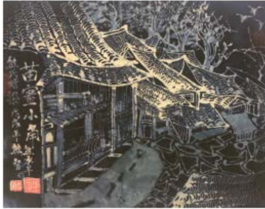
Fig.2 Xiong Chengzao's Representative Work "Xiaojiao of Miao Village"