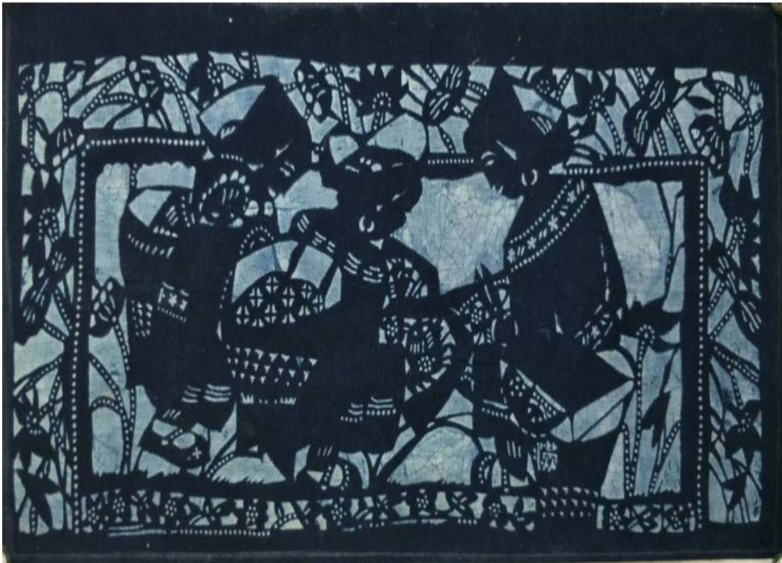
Fig.1 Batik Display

Batik is an ancient and unique art of hand-made painting and dyeing of the Chinese nation. Batik is the combination of batik and dyeing, and it was called wax picking in ancient times. Batik is to dip a wax knife into melted wax to draw various patterns on cloth and then dip it with indigo. After dyeing and removing wax, the cloth surface will show various patterns of blue flowers on white background or white flowers on blue background. At the same time, in the process of dip dyeing, the wax as a dyestuff will naturally crack, and there will be a special “ice pattern” on the cloth surface, which has unique charm. Because batik pattern is very rich, unique style, simple and elegant color, it is used to make clothing and various practical articles for life, which is quite simple and generous, fresh and pleasant to the eyes, rich in unique national characteristics. Batik works are shown in Figure 1