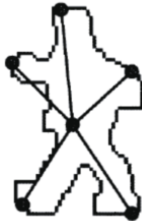
Figure 1: Star skeleton model