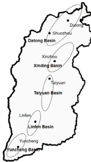
Fig.2 “One Vertical” Characteristic Sports Tourism Township Pattern