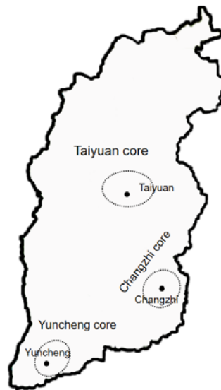
Fig.4 “Three Core” Characteristic Sports Tourism Township Pattern

The creation of sports tourism characteristic towns is a local practice for the country’s macroeconomic improvement to promote regional economic revitalization, and it is also an effective means to solve the unbalanced development of the urban-rural dual structure, the key point is to dig and build the characteristics of rural sports tourism. Only by inheriting and developing the characteristic culture of the town perfectly, can we gain a firm foothold in the process of implementing regional economic revitalization. The essence of building characteristic sports tourism town is to transform local economy into factor-driven market economy and space economy so as to increase “flow” and “quantity” for rural sports tourism, drive capital investment through the construction of industrial chain, and realize the model of sports tourism integration of special town construction.