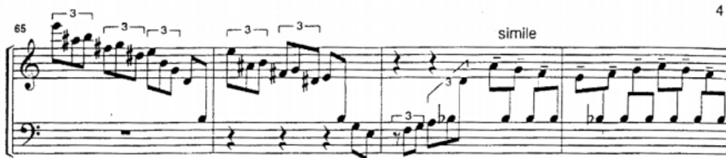
Fig.1 At the Beginning of the Music, the Bass Part Begins to Roll

In Marimba's works, triplet is a rhythm pattern that is often encountered. In the performance of triplet, attention should be paid to the power control of the music, and the melody is usually upward or downward. For example, in legend the triplet in the music is downward, so there should be a decrease in the strength. The processing of music should follow the change of music mood, pay attention to the accuracy of the rhythm of triplet, and pay attention to the clarity and accuracy of each note during the transformation to avoid the mixing of sounds.