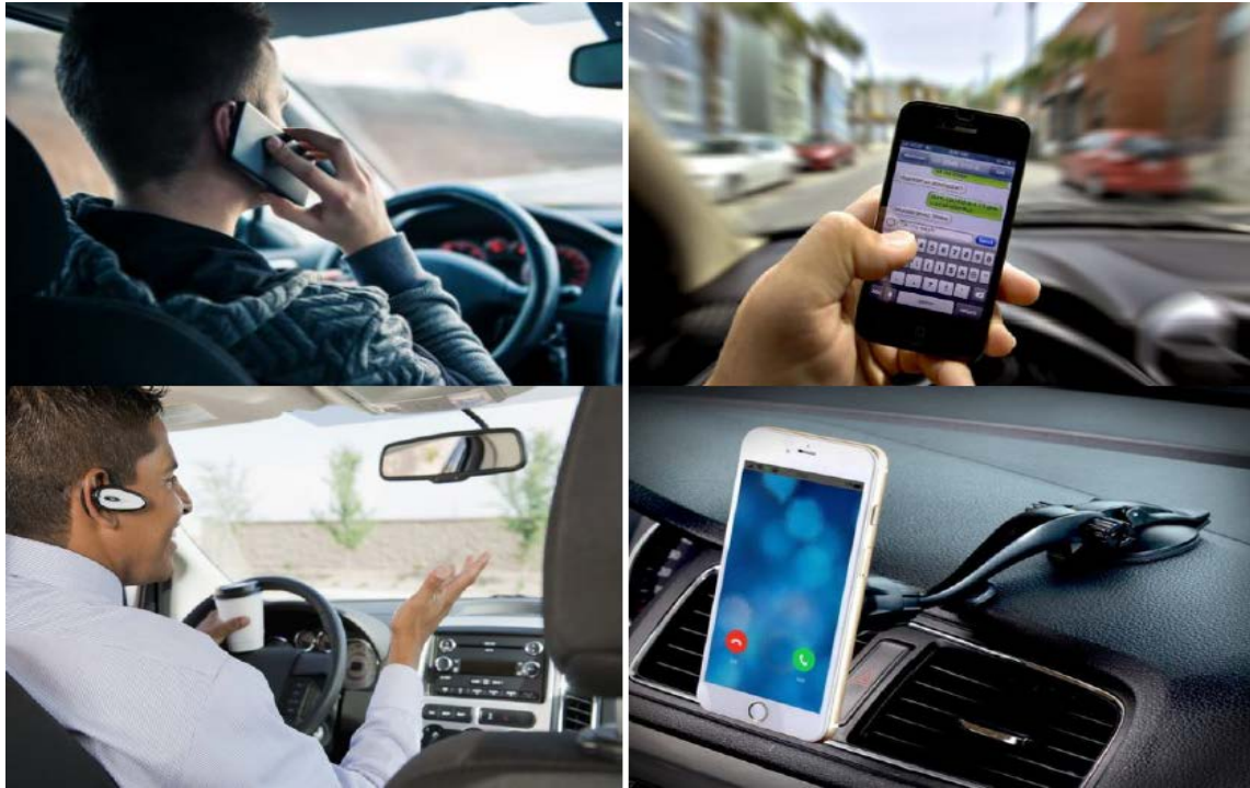
Fig. 1. Examples of mobile phone use while driving.