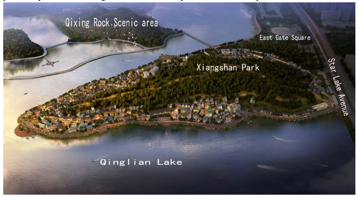
Fig3 Bird 's-eye view azimuth map of rockfront village

the problem of vegetables in the lives of ordinary residents. Of course, these gardens need designers, plant experts and villagers to create a productive landscape with local characteristics.