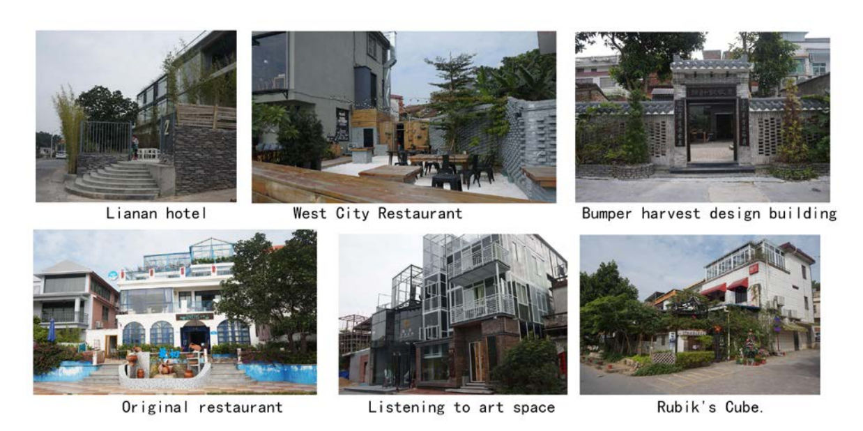
Fig2 Creators investment bar, design hall, lodging